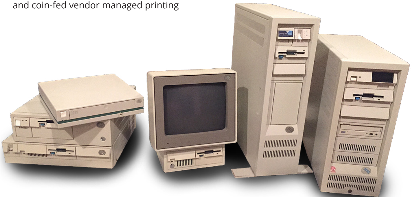
An assortment of Personal System/2 by IBM in various form factors, released in 1987. These used 3.5 floppy disks and the VGA video standard, providing a palette of 262,144 colors. These computers would have run Windows 3.0.

Primary use was Microsoft Office, multiple statistical packages and medical education applications