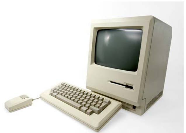
A rendering of the 1986 Macintosh