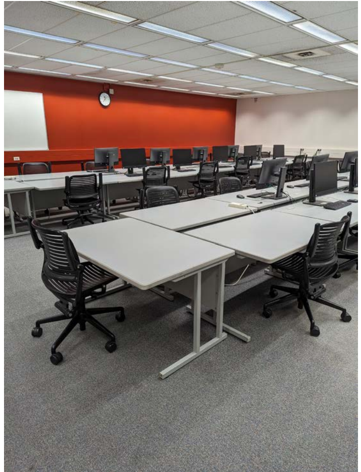
View of the Commons computer lab in 2023 (above) and view from the help desk (left) - photos taken July 24, 2023

The evolution of exams and testing: By 2016, use of the Commons changed due to UW's School of Medicine laptop curriculum requirement. With each student required to supply their own laptop, the demand for a drop in computer center reduced.