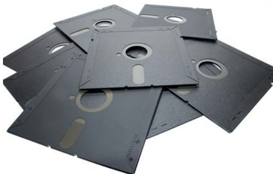
8-inch floppy disks, a type of disk storage composed a flexible disk of magnetic storage medium enclosed in a piece of square plastic. This size quickly was discarded in favor of the smaller 5.25 and 3.5 inch floppy disks. The latter can still be used today with the help of an external USB floppy disk drive.