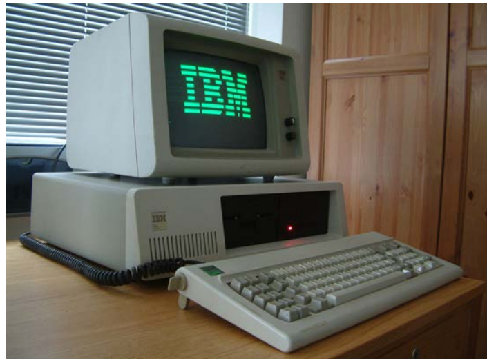
A 1983 IBM PC XT with green monochrome phosphor screen and 10MB hard disk drive

Name: Health Sciences Microlab Governance: Health Sciences Classroom Services Dates: 1985-1990 Size: 1688 square feet Staff: 2.5 FTEs, 8 part time students